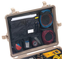
1609 Lid Organizer