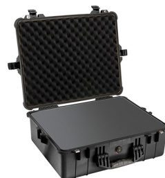
1600WF With Foam