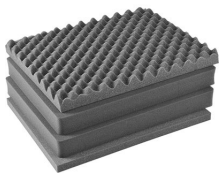
1601 4 pc. Replacement Foam Set