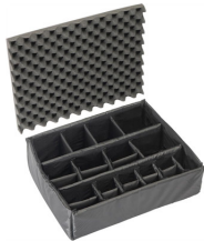
1605 Padded Divider Set