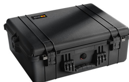
1600NF No Foam