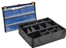
1605EMS EMS Accessory Set (Lid Organizer and Divider Set)