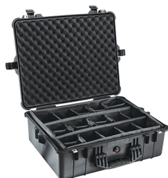
1604 With Padded Dividers