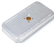
1500D Desiccant Silica Gel