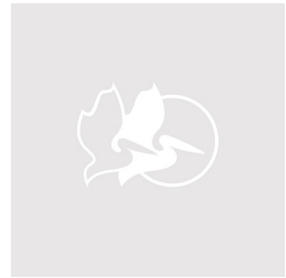
AL4824-1604RPFC With Foam, With Casters