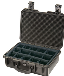
iM2200-X0002 With Padded Dividers