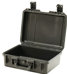
iM2200-X0000 No Foam