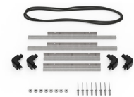
iM2200-M4-BEZEL-L Lid Bezel Kit (Metric)