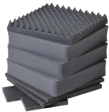
0351 7 pc. Replacement Foam Set