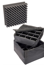
0355 Padded Divider Set