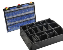
1555EMS EMS Accessory Set (Lid Organizer and Divider Set)