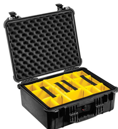
1554 With Padded Dividers