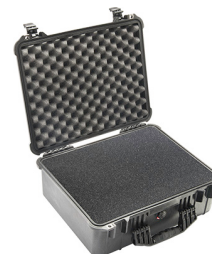
1550WF With Foam