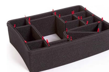
1550EUTP TrekPak Case Divider Kit