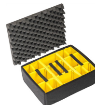
1555 Padded Divider Set