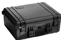
1550NF No Foam