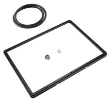
1550PF Special Application Panel Frame