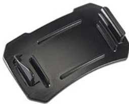
2748 Strapless Headlamp Adapter