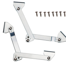
KIT-LIDSTAY-CARGO Cargo Lid Stays

23215 Early Ave • Torrance, CA 90505 USA • Phone: (310) 326-4700 • (800) 473-5422 • Fax: (310) 326-3311 sales@pelican.com • www.pelican.com