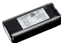
BAT05 Replacement Lithium Ion Battery Pack