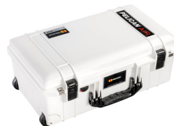
1535WWF With Foam