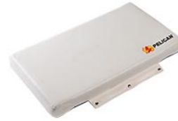
65-95QSEAT Seat Cushion - White