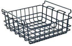
WBSM Dry Rack Basket