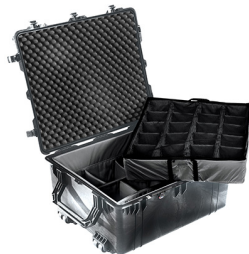
1694 With Padded Dividers