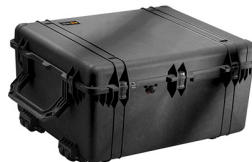
1690NF No Foam