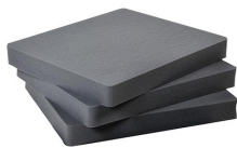
1692 Pick N Pluck™ Sections Only (set of 3)