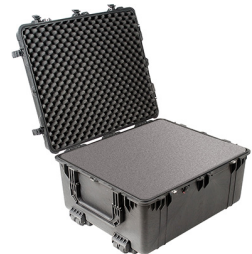
1690WF With Foam