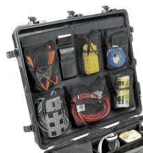
1699 Lid Organizer