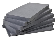
1781 6 pc. Replacement Foam Set