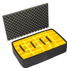
1675 Padded Divider Set