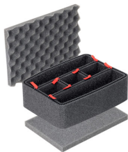
1150TPKIT TrekPak Case Divider Kit