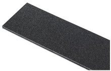
1150TPDIV Extra TrekPak Dividers