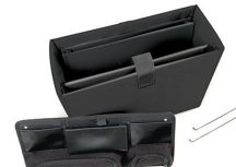
1436 Office Divider Kit