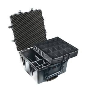
1644 With Padded Dividers