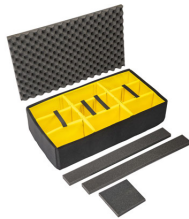
1615AirDS Padded Divider Set