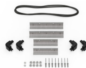
iM20XX-M4-BEZEL Base Bezel Kit (Metric)