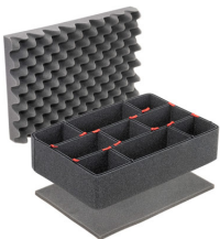
iM2300TPKIT TrekPak Case Divider Kit