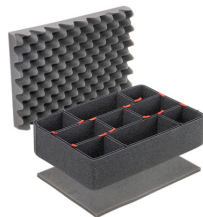
iM2300TPKIT TrekPak Case Divider Kit