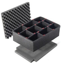
iM2450TPKIT TrekPak Case Divider Kit