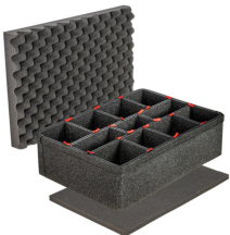
iM2600TPKIT TrekPak Case Divider Kit