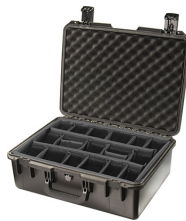
iM2600-X0002 With Padded Dividers