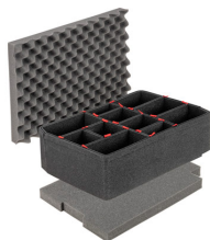
iM2620TPKIT TrekPak Case Divider Kit