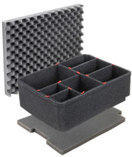
iM2720TPKIT TrekPak Case Divider Kit