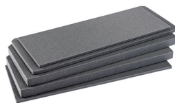
V700FS 4 pc. Replacement Foam Set