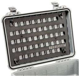
1500MP EZ-Click™ MOLLE Panel