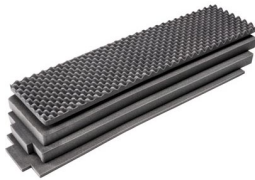
1755AirFS 4 pc. Replacement Foam Set