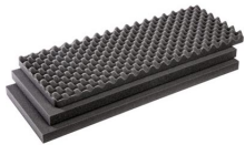
1701FS 3 pc. Replacement Foam Set