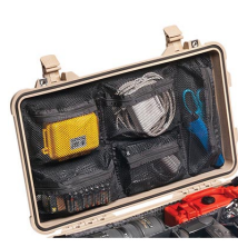
1519 Lid Organizer