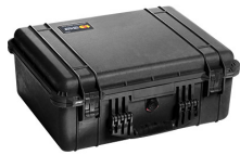
1550NF No Foam