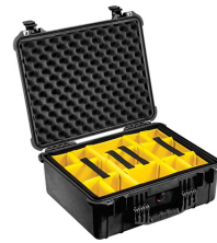
1554 With Padded Dividers