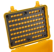
1560MP EZ-Click™ MOLLE Panel