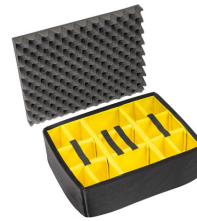
1565 Padded Divider Set