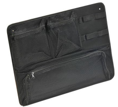
1569 Lid Organizer