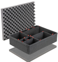
1600TPKIT TrekPak Case Divider Kit