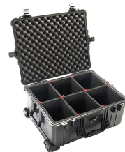
1610TP With TrekPak Divider System