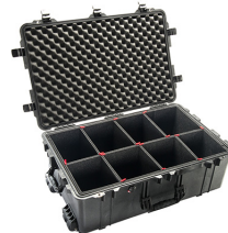
1650TP With TrekPak Divider System