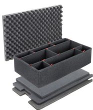
1650TPKIT TrekPak Case Divider Kit