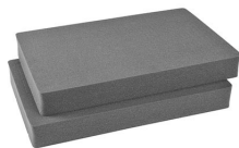
1652 Pick N Pluck™ Sections Only (set of 2)