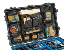
1659 Photo/Lid Organizer