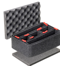
1120TPKIT TrekPak Case Divider Kit