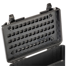
1535MP EZ-Click™ MOLLE Panel