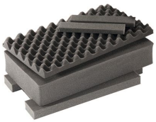
1535AirFS 5 pc. Replacement Foam Set