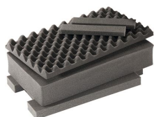
1535AirFS 5 pc. Replacement Foam Set