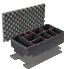
1535TPKIT TrekPak Case Divider Kit