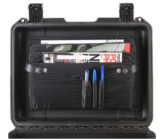
iM24XX-LIDORG Lid Organizer