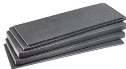
V730FS 4 pc. Replacement Foam Set