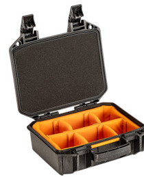
V100WD With Padded Dividers