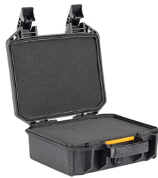
V100WF With Foam