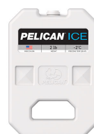
PI-2LB 2lb Ice Pack