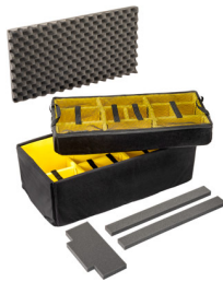
1626AirDS Padded Divider Set