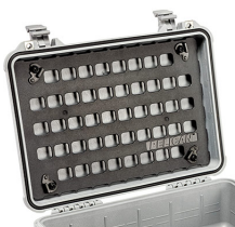
1500MP EZ-Click™ MOLLE Panel