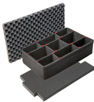
1595TPKIT TrekPak Case Divider Kit