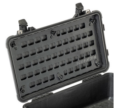
1510MP EZ-Click™ MOLLE Panel