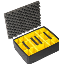
1555 Padded Divider Set