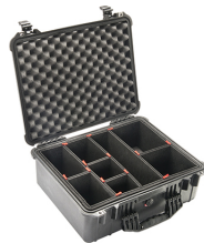
1550TP With TrekPak Divider System