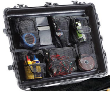
1639 Lid Organizer