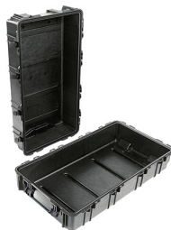
1780NF No Foam