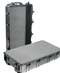
1780WF With Foam