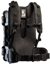
RucPac-Pro-1 RucPac Pro Hardcase Backpack Conversion