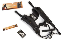
RucPac-normal RucPac Standard Hardcase Backpack Conversion