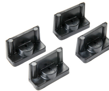
1507QM Quick Mounts - set of 4