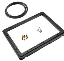
1200PF Special Application Panel Frame