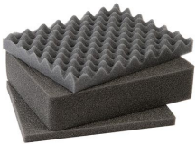
1201 3 pc. Replacement Foam Set