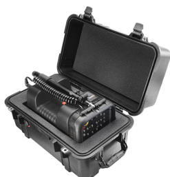
1460AALG With Custom Foam for 9430 / 9435