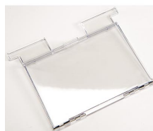
1630DC Document Container Accessory