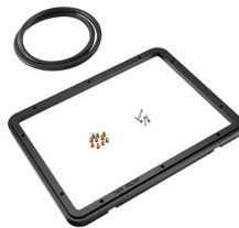
1400PF Special Application Panel Frame