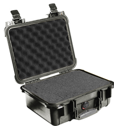
1400WF With Foam