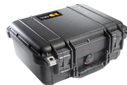
1400NF No Foam