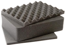
1401 3 pc. Replacement Foam Set